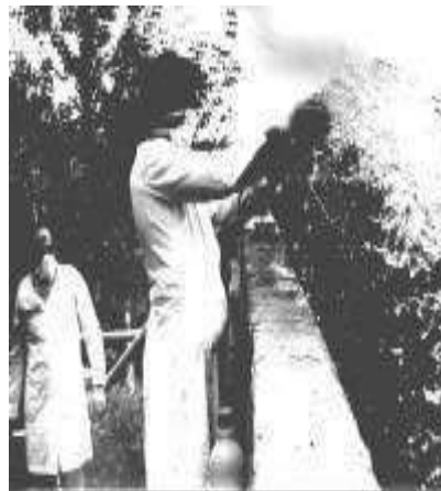
Water ... The Black Gold