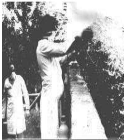
Water ... The Black Gold