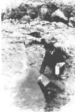
Aghios Kosmas 1981

Members of: United Nations Environment PROGRAM - ECOROPA - IUCN - IFOAM