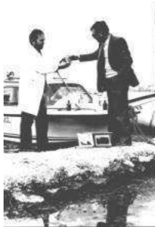
Aghios Kosmas 1981