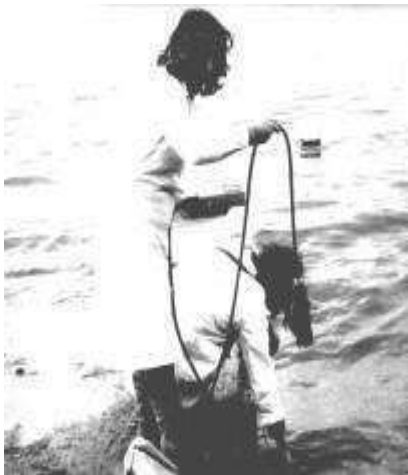
Continuous measurements since 1981